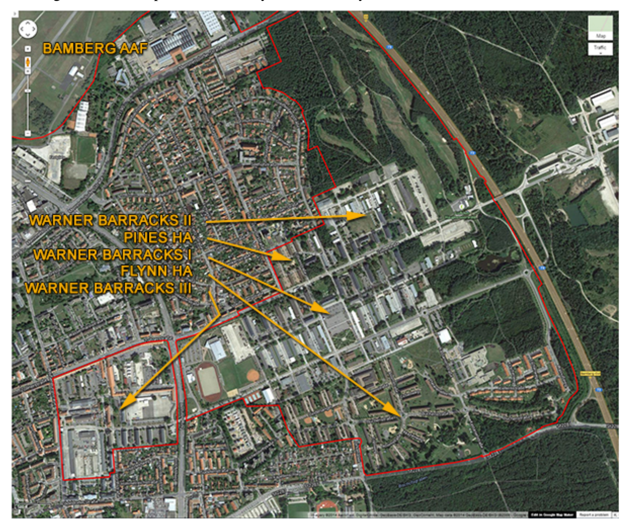
Fig. 1: The three different sites of Warner Barracks and American housing areas in Bamberg. Part I and II (including pines area) is occupied today by the federal Police's training facilities, Flynn housing area is a refugee camp and in part III the new "Lagarde-Campus" is considered for urban development.

depot ("Muna") and a small airfield. The Warner Barracks themselves can be partitioned, once again, into three parts, renamed by the U.S. Army in Warner Barracks I, II and III.